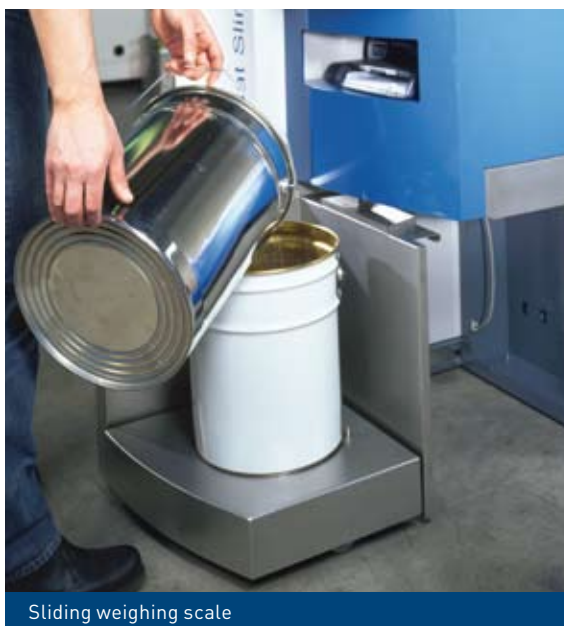
Sliding weighing scale