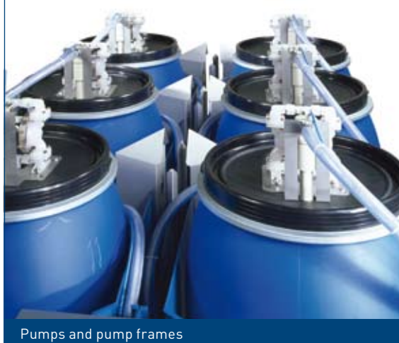
Pumps and pump frames