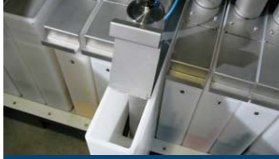
Internal storage tank