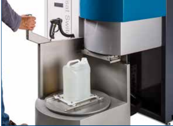
Sliding weighing tray with optional turntable