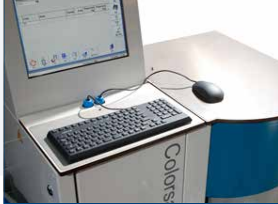
Ex-proof execution for solvent-based inks