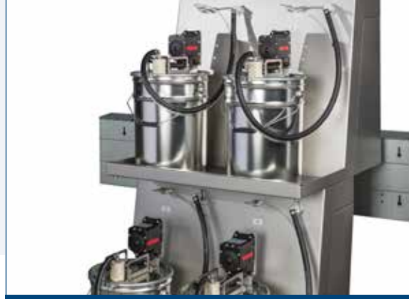
Base components on 'waterfall frames'

Built on GSE's proven ink dispensing technology, the Switch gives you ultimate reliability, speed and accuracy. The sliding weighing tray allows easy placing, filling and removing of ink buckets at an ergonomically designed working height.