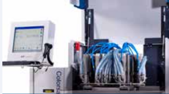
Easy access to key components

The Colorsat® Compact offers a modular, and refreshingly affordable approach to ink management for the wall covering and packaging printer.