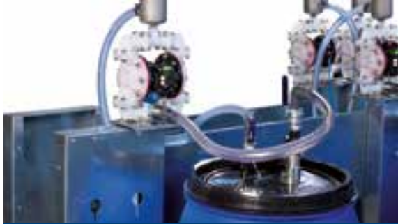
Modular, flexible tray for pumps and hoses