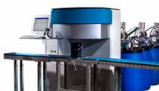
Conveyor system for dispensing smaller batches