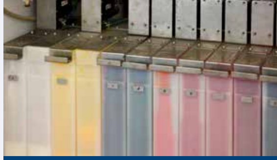
Internal storage tank