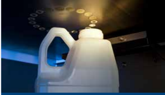
Dispensing in small openings with optional turning table