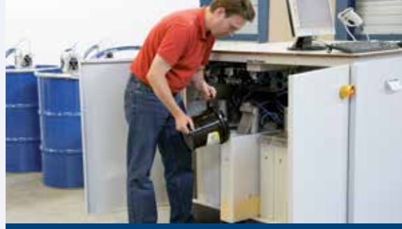
Easy refilling of ink containers

The Colorsat Match automatic ink dispenser sets the standard for assuring repeatable colour accuracy in label and narrow web printing, when floor space is limited. With a modular design including easily accessible, refillable base components and an integrated worktop, the Match blends UV and water-based spot colours fast, accurately and productively within a small footprint.