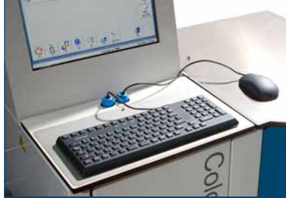
Ex-proof execution for solvent-based inks