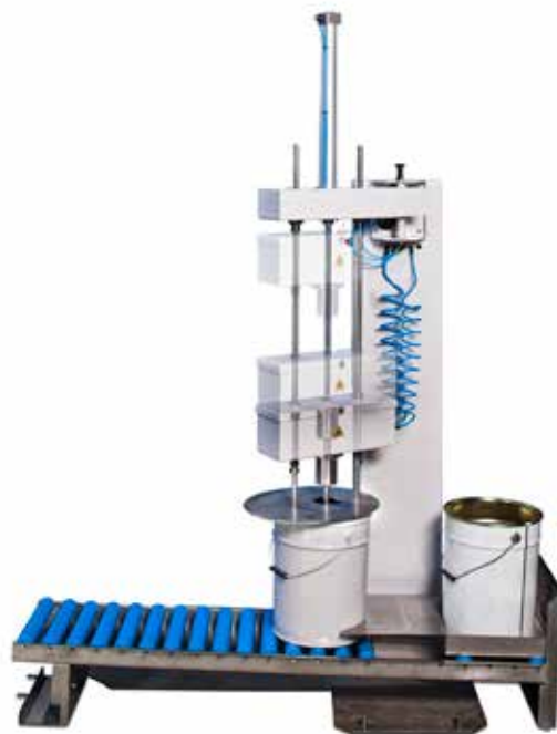
Colormix manual blender

The Colormix range of manual, semi-automatic and automatic pneumatic blenders are suitable for homogenisation of dispensed inks in buckets. The blenders are equipped with a roller conveyor and can be integrated with an optional manual or automatic system for bucket transport. The blender can be turned over a bucket with detergent, water or solvent, which makes it suitable to clean the blender blades and the shaft.