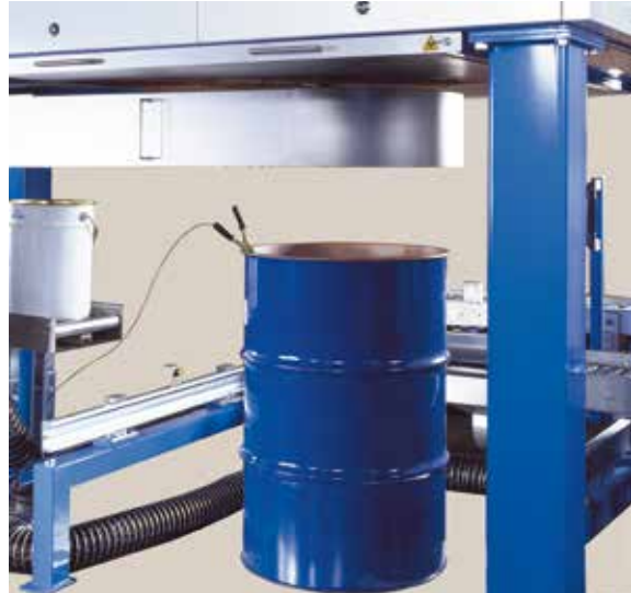
Dispensing into a 200 litre drum