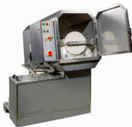
Colorclean Indigo bucket washer with water saving system

These fully-automated drum and bucket washers are an easy and efficient way of cleaning containers used to store ink. Water is forced through a series of rotary brushes that clean the inside and outside of the containers. The washer is virtually maintenance free and has a stainless steel housing. And with the optional water saving system you save 50-80% of your water consumption.