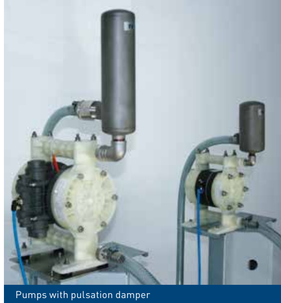
Pumps with pulsation damper