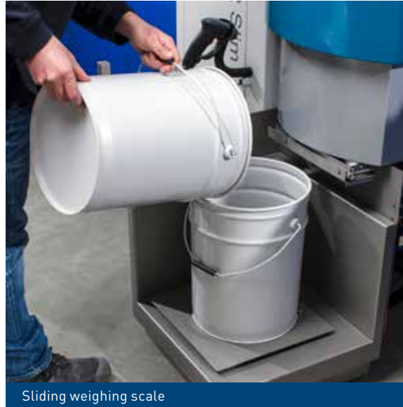
Sliding weighing scale