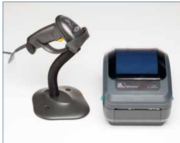
Optional barcode package