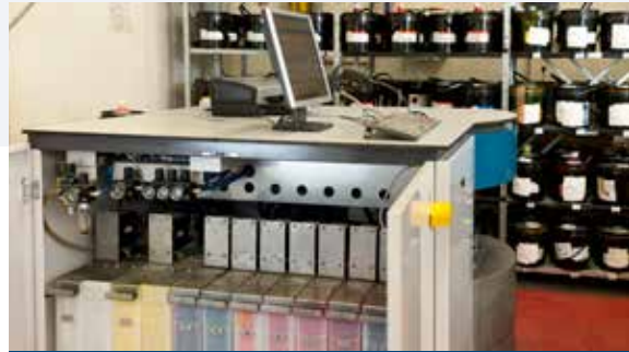
Internal storage tanks of the Colorsat Match