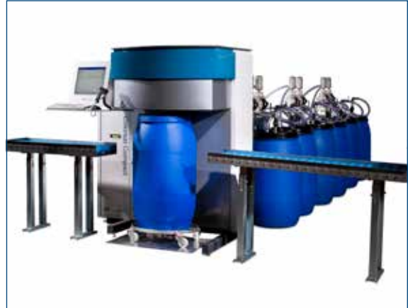
High version for dispensing larger batches