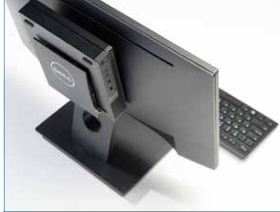
Computer mounted to the monitor